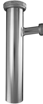
For Hose and Copper Tubing