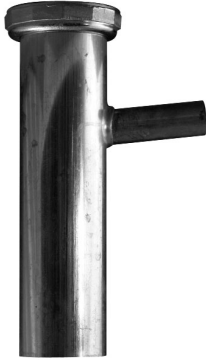
For Copper Tubing