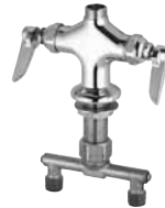
See p. C15