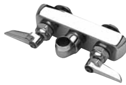
See p. C30