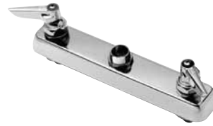
See p. C30