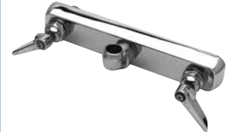
See p. C31