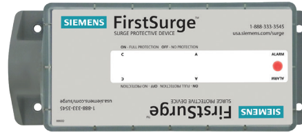
FirstSurge™ Surge Protection Device

For more information on the Surge Protection product line, see Section 10 and Section 7 Page 7-28 of the Speedfax at usa.siemens.com/speedfax .