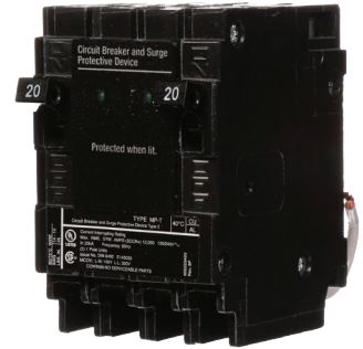
QSA Circuit Breaker and Surge Protection Device