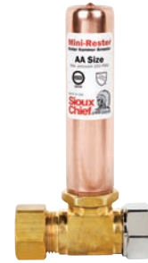
660-TRB 5/8" O.D. compression x 5/8" O.D. female compression