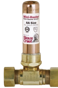
660-TB 5/8" compression tee