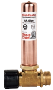
660-TKB female x male ballcock thread