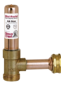
660-H 3/4" hose thread