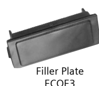
Filler Plate ECQF3