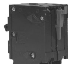
Main Breaker Retainer Kit ECMBR2