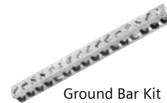
Ground Bar Kit ECGB14