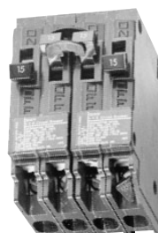
Dual Tie Handle ECQHT2