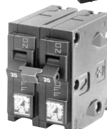
2-Pole Tie Handle ECQHT3