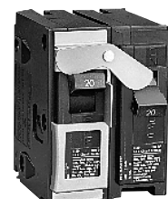
Mechanical Interlock ECQML12