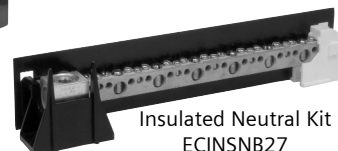
Insulated Neutral Kit ECINSB27