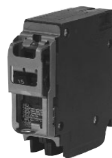
Padlocking Device ECPLD1