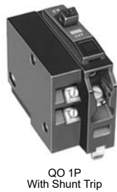
QO 1P With Shunt Trip

QO-EPD/EPE circuit breakers provide overload and short circuit protection combined with Class B ground fault protection. They are designed to provide ground fault protection of equipment at a 30 mA level (EPD) or 100 mA level (EPE). They are not designed to protect people from electrical shock.