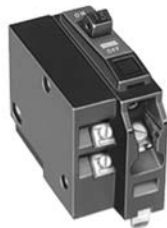
QO 1P With Shunt Trip

QO-EPD/EPE circuit breakers provide overload and short circuit protection combined with Class B ground fault protection. They are designed to provide ground fault protection of equipment at a 30 mA level (EPD) or 100 mA level (EPE). They are not designed to protect people from electrical shock.