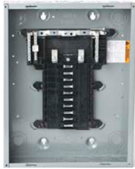
QO Load Center