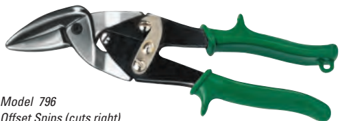
Model 796 Offset Snips (cuts right)