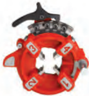
No. 816/817 Semi-Automatic