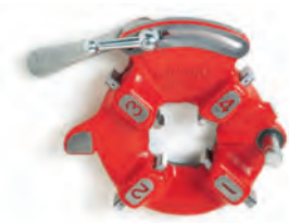
No. 811A Quick-Opening Die Head