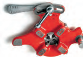
Mono Die Head