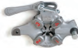
No. 532 Bolt Die Head