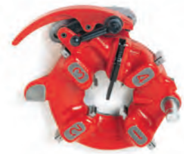
No. 815A Self-Opening Die head