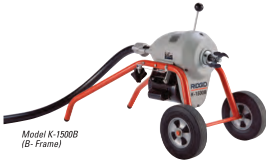
Model K-1500B (B-Frame)