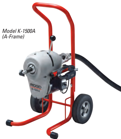
Model K-1500A (A-Frame)