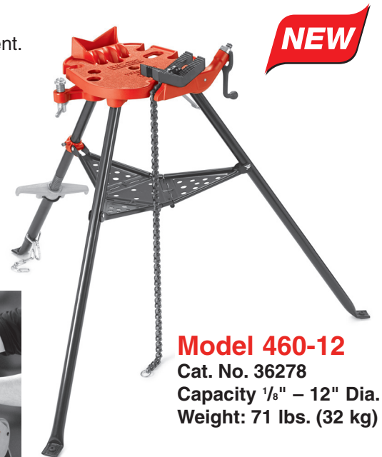
Model 460-12 Cat. No. 36278 Capacity 1/8" – 12" Dia. Weight: 71 lbs. (32 kg)