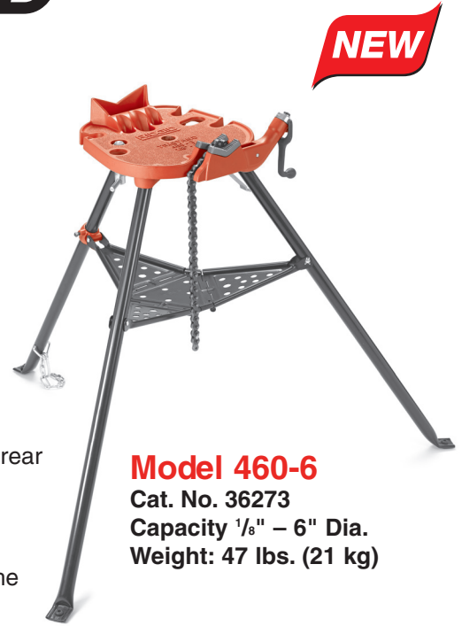
Model 460-6 Cat. No. 36273 Capacity 1/8" – 6" Dia. Weight: 47 lbs. (21 kg)