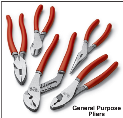
General Purpose Pliers

Designed with Tool Professionals to meet the demands of the most intense applications in the field. RIDGID's new pliers and linesmen tools are made in the U.S.A. and precision crafted and engineered for long service life and ease of use. The cutting edges and teeth are sharpened using a special process to ensure longer usable life. See why RIDGID designs tools for the most demanding of users.