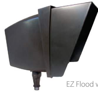
EZ Flood with Visor