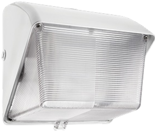
Compact Wallpack. UV stabilized, vandal resistant prismatic polycarbonate refractor. Lamp supplied.