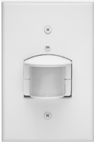
Control 500 Watts from an unobtrusive box mounted sensor. Full 180° view with tilt-down adjustment. Integral oversize wall plate included. Fits single gang cast box.