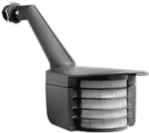
Luminator sensor with 110° view, manual override, 300 Watt switching capacity and auto test logic.