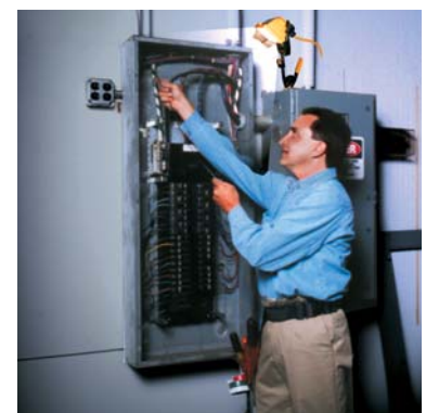
Get light on the job. You'll work safer and faster. Designed for electrical pros.