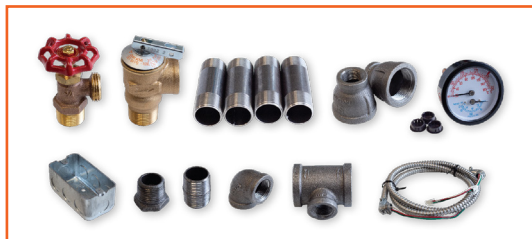
Included Parts Kit