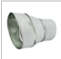
Optional 4" Oval to 3" Round Duct Adapter (Model #: FV-VS43R)