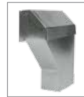
Optional Transfer Register Box (Model #: FV-JD)