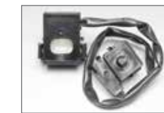
NiteGlo™ LED Night Light* (FV-NLVK1)