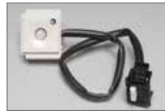
SmartAction® Motion Sensor* (FV-MSVK1)