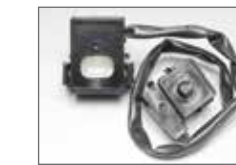
NiteGlo™ LED Night Light* (FV-NLVK1)