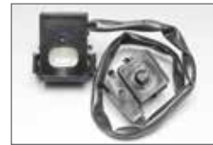
NiteGlo™ LED Night Light* (FV-NLVK1)