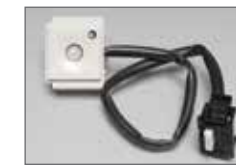
SmartAction® Motion Sensor* (FV-MSVK1)