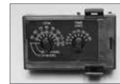
Pre-installed Multi-Speed with Time Delay