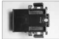
Condensation Sensor* (FV-CSVK1)