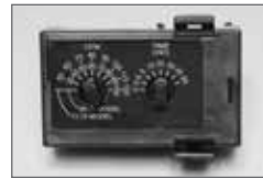
Multi-Speed with Time Delay* (FV-VS15VK1)