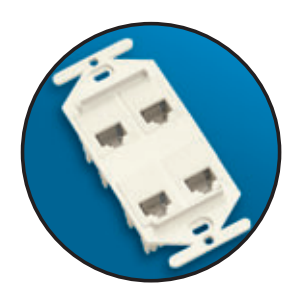
New 4-port frame for use with Decorator-style plates.