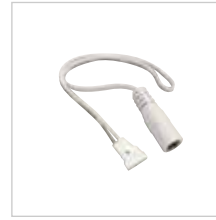
Power Line Interconnector

Allows easy linking of two Tape Light sections. Cables are flexible and can be moved in any direction, or be joined together for custom lengths.