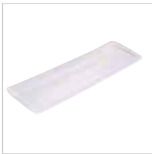
Shrink Wrap Tube

Allows individual switching on any Tape Light run, and connect LED Tape Light run directly to LED Driver. 24V cable is white & 12V cable is black.