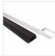
2' Wire Raceway

NATL-401 Pack of 15 Use in conjunction with adhesive backing to attach Tape Light to a surface. Pack of 15 clear acrylic mounting clips are included with every Tape Light roll.