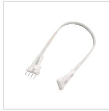
12/24V Interconnection Cable

NATL-301W 12V or 24V Allows splitting the Tape Light from a run or driver, into three separate runs.