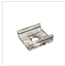
Clear Acrylic Mounting Clips

NATL-403 B or W Covers open end of Tape Light. Available in Black or White.