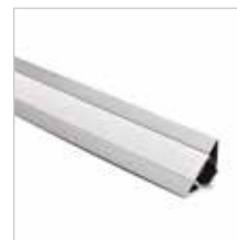
4' Corner Aluminum Channel

Used to mount tape light to various surfaces. Field cuttable.