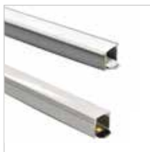
4' Deep Aluminum Channel

Used to mount tape light to various surfaces. Plastic diffuser and end caps included. Field cuttable