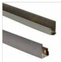
4' J-Style Aluminum Channel

Used to mount tape light to various surfaces. Plastic diffuser and end caps included. Field cuttable