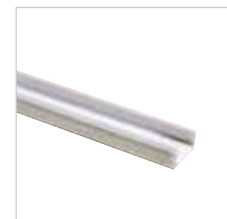
4' Plastic Channel

Used to mount tape light to various surfaces. Plastic diffuser and end caps included. Field cuttable.