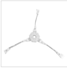
"Y" Splitter Cable

NATL-300W 12V or 24V Allows splitting the Tape Light from a run or driver, into two separate runs.