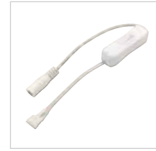
Power Line Interconnector with On/Off Switch

NATL-509W 24V 9" Cable NATL-515W 12V 9" Cable Connects any Tape Light run to a driver. (1) Power line interconnector is included with every Tape Light roll/kit.