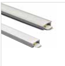
4' Shallow Aluminum Channel

NATL-422 B or W Field-cutttable plastic. Includes wire channel with double faced tape and cover. Available in Black or White.