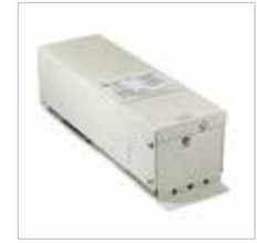
Class II Hardwire LED Driver with Breakers, MLV Dimming

Input Voltage: 120-277V Dimming: 0-10V Includes: 10' Power Line Connector