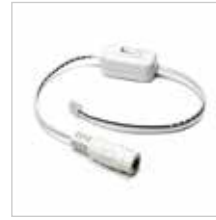
12" Power Line Interconnector with Switch

Used to connect two interconnection cables together or to add interconnection cable to power line interconnector. Dim.: 3/8" W; 3/4" L; 1/4" H