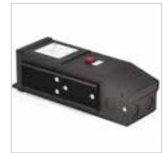
Class II Hardwire LED Driver with Regulator

Input Voltage: 120V Dimming: N/A for RGB/CCT tape Includes: (3 or 4) 10' Power Line Connectors