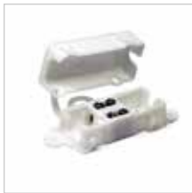
Low Voltage Splice Box

72W max., no power fail memory, touch on/off and hold to dim.