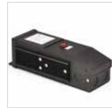
Class II Hardwire LED Driver with Regulator, MLV Dimming

Voltage: 120-277V/12V Wattage: 60W Dimming: 0-10V Includes: 10' Power Line Connector