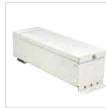
Class II Hardwire LED Driver 0-10V Dimming

Voltage: 120V/12V Wattage: (4) 60W Dimming: Magnetic Low Voltage Includes: (4) 10' Power Line Connectors