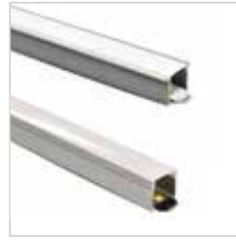
4' Deep Aluminum Channels

Used to mount tape light to various surfaces. Plastic diffuser and end caps included. Field cuttable.