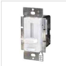
NEXUS® All-in-One LED Driver and Dimmer

12' Max activation distance; 20 second auto off; 120° detection zone; Max Load 4A.