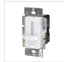
NEXUS® All-in-One LED Driver and Dimmer

Use to join low voltage lead to low voltage power line connector or interconnector.