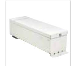
Class II Hardwire LED Driver 0-10V Dimming