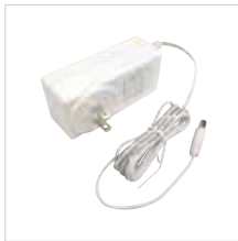
Direct Plug-In LED Driver

Note: Dimming drivers are only for powering RGB and CCT tape. Do not use for dimming. Dimming is controlled by hand held remote and wall controls.