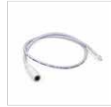
18" Power Line Interconnector

Allows individual switching of any LED Puck Light run.