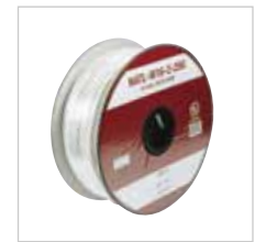
16AWG In-Wall Rated Wire

Use to join low voltage lead to low voltage power line connector or interconnector.