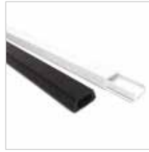
2' Wire Raceway

Finish: Black (B), White (W) Used to extend the length of the cable from the puck to the terminal block. Linkable up to 110".