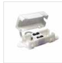
Low Voltage Splice Box

Splits power line connector into two separate leads, requires power line interconnects. Available in black or white.