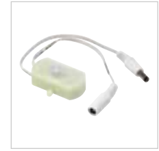
DC Plug and Play Motion Sensor

72W max., no power fail memory, touch on/off and hold to dim.