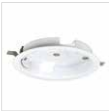
Recessed Housing Accessory