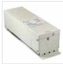
Class II Hardwire LED Driver with Breakers, MLV Dimming

Voltage: 120-240V/12V Wattage: 30W or 60W Dimming: Non-Dimmable Includes: 10' Power Line Connector