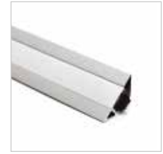
4' Corner Aluminum Channel

Used to mount tape light to various surfaces. Field cuttable.