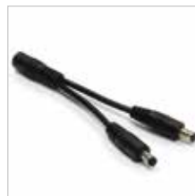
5' Power Line Splitter

For use with Class II drivers. Carries output from driver, requires power line interconnectors.