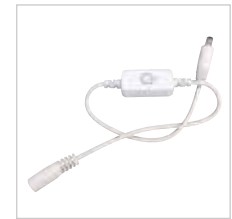
Touch Dimmer with Memory

Splits power line connector into two separate leads, requires power line cable. Available in Black or White.