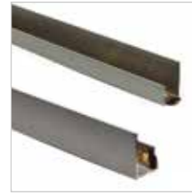
4' J-Style Aluminum Channels

Used to mount tape light to various surfaces. Plastic diffuser and end caps included. Field cuttable.