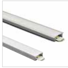
4' Shallow Aluminum Channel

Used to mount tape light to various surfaces. Field cuttable.