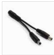
Power Line Splitter

Carries output from driver, requires power line cable.