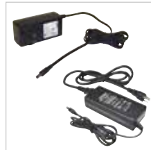
Direct Plug-In LED Driver

Description: Eliminates the driver and allows 120V input and 12V output from a single gang box. 100-5% dimming and on/off switch.