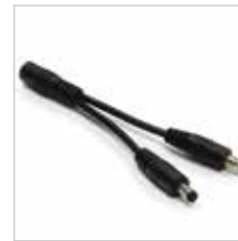
5" Power Line Splitter

For use with Class II drivers. Carries output from driver, requires power line interconnectors.