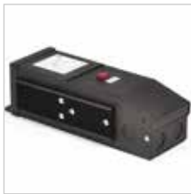
Class II Hardwire LED Driver with Regulator, MLV Dimming

Input Voltage: 120V Dimming: Magnetic Low Voltage Includes: (3 or 4) 10' Power Line Connectors