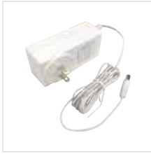
Direct Plug-In LED Driver

NAPK-524/12 12V 24W NATL-524W 24V 24W NATL-545W 24V 45W