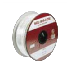
16AWG In-Wall Rated Wire

Splits power line connector into two separate leads, requires power line cable. Available in Black or White.