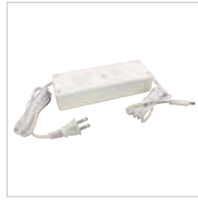
Direct Plug-In LED Driver

Input Voltage: 120V Cable Length: 6 Feet