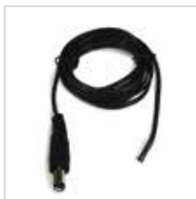
Power Line Connector

Input Voltage: 120-277V Dimming: N/A for RGB/CCT tape Regulator: Integral regulator for constant current and voltage Includes: 10' Power Line Connector