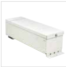
Class II Hardwire LED Driver

Voltage: 120V/12V Wattage: 24W or 50W Dimming: Non-Dimmable Cable Length: 6' cord & plug and 60" power line connector for NAPK-550/12