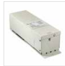
Class II Hardwire LED Driver with Breakers

Input Voltage: 120-240V Dimming: Non-Dimmable Includes: 10' Power Line Connector