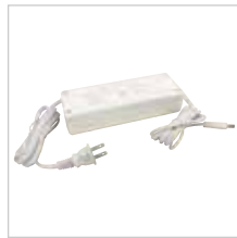
Direct Plug-In LED Driver

Input Voltage: 120V Cable Length: 6 Feet