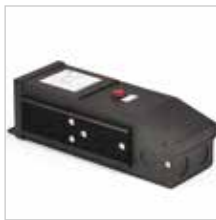
Class II Hardwire LED Driver with Regulator, MLV Dimming