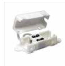
Low Voltage Splice Box

16 AWG low voltage Class II two-conductor, in-wall rated wire.