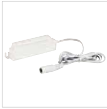
6-Port Power Line Interconnect