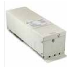
Class II Hardwire LED Driver with Breakers, MLV Dimming