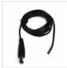
Power Line Connector

Field-cutttable plastic. Includes wire channel with double faced tape and cover. Black or White.