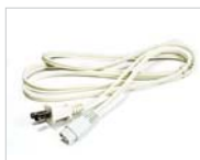
Flexible Power Cord NRA-6035W/6 6' NRA-6035W/10 10'