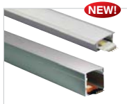
4' Aluminum Channel w/Lens NATL-C23 Shallow Wings NATL-C24 Shallow