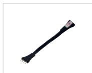
12V / 24V Interconnection Cables NATL-202 2" Cable NATL-206 6" Cable NATL-218 18" Cable NATL-236 36" Cable NATL-272 72" Cable