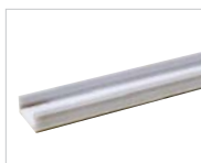
4' Channel NATL-420 Plastic B/W