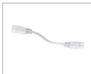
Flexible Extension Cord NRA-125/6 6" Cable NRA-125/12 12" Cable NRA-125/18 18" Cable NRA-125/72 72" Cable Use with NATL-530HW, 560HW to connect to NUSP-Jbox