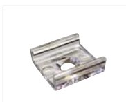
Mounting Clips NATL-401 Pack of 5