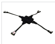
12V / 24V Splitter Cable NATL-301 "X" Cable