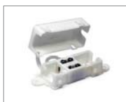
Low Voltage Splice Box NATL-415W