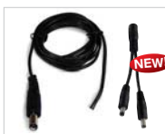
Power Line Connector NATL-10 24V, 10' NATL-30 24V, 30' NATL-302 24V 5" Splitter