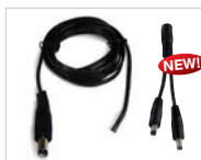
Power Line Connector NAPK-10 12V, 10' NAPK-30 12V, 30' NALTL-10 24V, 10' NALTL-30 24V, 30'