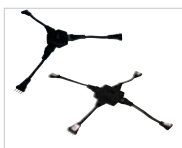
24V Splitter Cables NARGBW-900 "Y" NARGBW-901 "X"