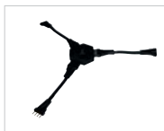
12V / 24V Splitter Cable NATL-300 "Y" Cable