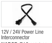
12V / 24V Power Line Interconnector NARGB-710 12" Cable