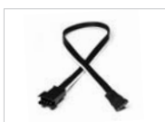
24V Power Line Interconnector NARGBW-910 12"