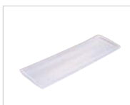
Shrink Wrap Tubes NATL-400 Pack of 5