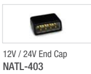
12V / 24V End Cap NATL-403