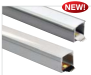
4' Aluminum Channel w/Lens NATL-C25 Deep Wings NATL-C26 Deep