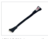
12V / 24V Interconnection Cables NARGB-702 2" Cable NARGB-706 6" Cable NARGB-718 18" Cable NARGB-736 36" Cable NARGB-772 72" Cable