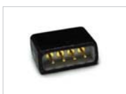
End Cap NATL-403