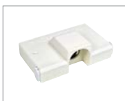
Junction Box for Hard Wiring NUSP-JBox