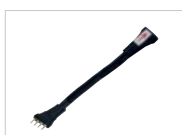
24V Interconnection Cables NARGBW-902 2" Cable NARGBW-906 6" Cable NARGBW-918 18" Cable NARGBW-936 36" Cable NARGBW-972 72" Cable