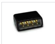
End Cap NATL-403 12V / 24V