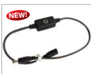
In-Line Dimmer NATL-518 212V & 24V 60W Max (12V) 120W Max (24V)