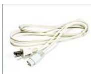
Flexible Power Cord NRA-6035W/6 6' NRA-6035W/10 10' use with NATL-530HW, 560HW