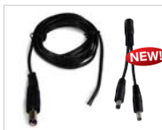
Power Line Connector NAPK-10 12V, 10' NAPK-30 12V, 30' NALTL-10 24V, 10' NALTL-30 24V, 30' NATL-302 24V 5" Splitter