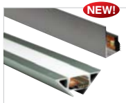
4' Aluminum Channels NATL-C27 J-Style NATL-C28 Corner w/Lens