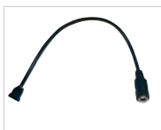
Power Line Interconnector NATL-509 24V, 9" NATL-515 12V, 9"