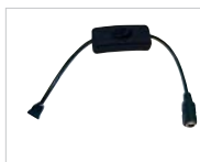
Power Line Interconnector with Switch NATL-511 24V, 11" NATL-517 12V, 11"