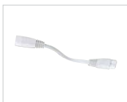
Flexible Extension Cord NRA-125/6 6" Cable NRA-125/12 12" Cable NRA-125/18 18" Cable NRA-125/72 72" Cable