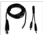
Power Line Connector NALTL-10 10' Cable NALTL-30 30' Cable NATL-302 5" Splitter