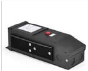
24V Dimmable Class II Remote Hardwire Magnetic Driver with Integral Regulator for Constant Current and Voltage 120/277V input NMT-303/24C2D1 3x100W NMTD-60/24D 60W NMTD-96/24D 96W Includes NALTL-10 Power Line Connector