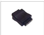
Mini Coupler NAL-220