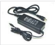
Class II Electronic LED Driver NATL-550/12 12V 50W NATL-596 24V 96W