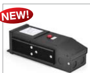
NEW! Dimmable Class II Remote Hardwire Magnetic Driver with Integral Regulator for Constant Current & Voltage NMTD-60/24D* 60W NMTD-96/24D* 96W Includes NALTL-10 · 120/277V input