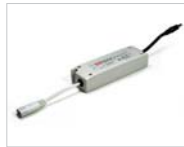
Hardwired Class II Electronic Driver NAPK-530HW/12 12V 30W NAPK-560HW/12 12V 30W NATL-530HW 24V 30W NATL-560HW 24V 60W Requires NUSP-JBox or NRA-6035 and power line interconnector