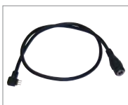
90° Power Line Interconnector NAL-207 20" Cable NAL-207/72 72" Cable