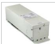
Dimmable Class II Remote Hardwire Magnetic Driver with Integral Regulator for Constant Current and Voltage NMT-303/24C2D1*† 3x100W Includes (3) NALTL-10