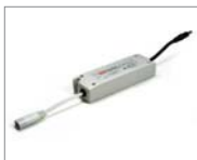
Hardwired Class II Electronic Driver NATL-530HW 30W NATL-560HW 60W Requires NUSP-JBox or NRA-6035 and power line interconnector