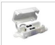
Low Voltage Splice Box NATL-415W