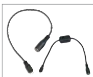
Power Line Interconnector NAL-208 20" Cable NAL-208/72 72" Cable NAL-212 12" w/ Switch