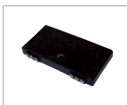
Mini Power Feed Splitter NAL-221 One in and four out