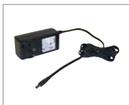
Plug-In Electronic Driver NATL-524 24W NATL-545 45W Requires NUSP-JBox or NRA-6035