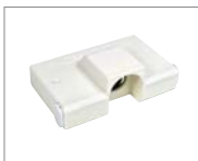
Junction Box for Hard Wiring NUSP-JBox