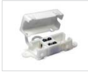
Low Voltage Splice Box NATL-415W