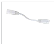
*Flexible Extension Cord NRA-125/6 6" Cable NRA-125/12 12" Cable NRA-125/18 18" Cable NRA-125/72 72" Cable Use with NATL-530HW,560HW to connect to NUSP-Jbox