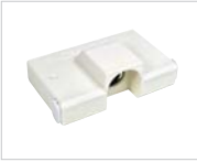
Junction Box for Hard Wiring NUSP-JBox