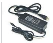
Class II Electronic LED Driver NATL-596 24V 96W