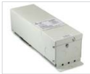
Class II Electronic LED Driver (Non Dimmable) NATL-5060HW 24V 60W NATL-5100HW 24V 100W Includes hardwire box and NALTL-10 power line connector