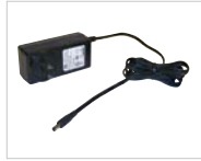
Plug-In Electronic Driver NAPK-524/12 12W 24V DC NATL-524 24W 24V DC NATL-545 45W 24V DC Requires power line interconnector