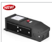
Dimmable Class II Remote Hardwire Magnetic Driver with Integral Regulator for Constant Current and Voltage 120/277V Input NMTD-60/24D* 60W NMTD-96/24D* 96W Includes NALTL-10 Power Line Connector