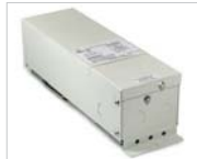
12V Dimmable Class II Hardwire Magnetic Driver with Integral Regulator for Constant Current and Voltage NMT-244/12C2D1 4x60W NMTD-40/12D 40W NMTD-60/12D 60W Includes NAPK-10 Power Line Connector