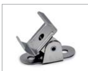
Adjustable Mounting Clip NAL-280 (BZ, C) Rotates 180 degrees

NAL-201 (BZ, C) Flat - 0°, 10°, 23° NAL-245 (BZ, C) Angled - 45°, 53°, 65° Included with each Lightbar