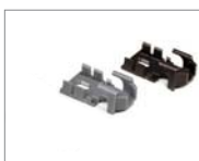
Connector Retainer Clip NAL-270 (A, BZ)