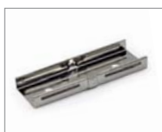
Bar to Bar Joiner NAL-225 (BZ, C)