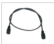
Interconnection Cables NAL-202 2" Cable NAL-206 6" Cable NAL-218 18" Cable NAL-238 38" Cable NAL-258 58" Cable

* Special Power Line Interconnector must be used to power system.