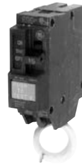
Figs. W – AC GF115