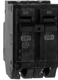
Figs. K – O, S – U CB220