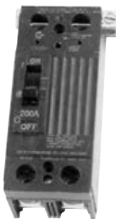
Figs. HH – JJ LCB2201