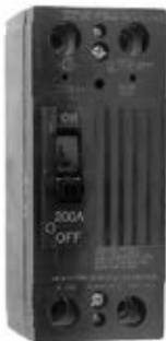
Figs. BB – DD, QQ – SS CB2201