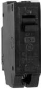
Figs. A – E CB115