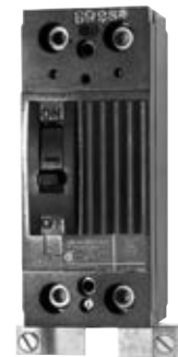
Figs. EE – GG CBL2201