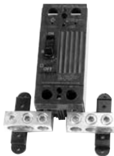
Figs. LL – MM CBT2201