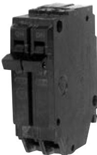
Figs. P – R CB220T