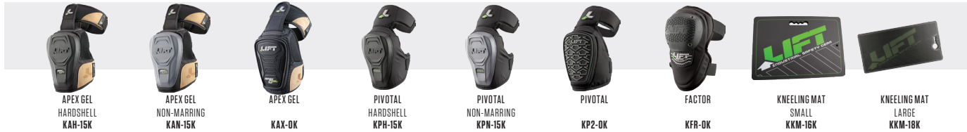
APEX GEL HARDSHELL KAH-15K