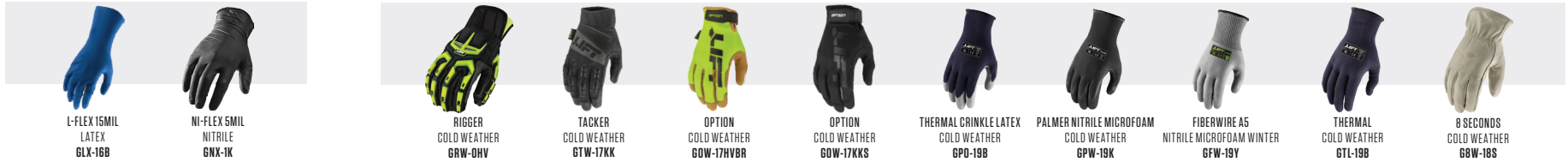
L-FLEX 15MIL LATEX 6LX-16B