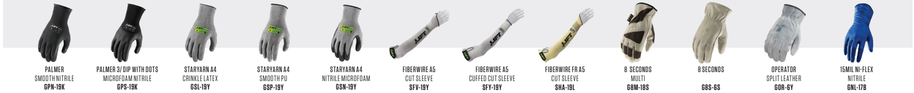
PALMER SMOOTH NITRILE 6PN-19K