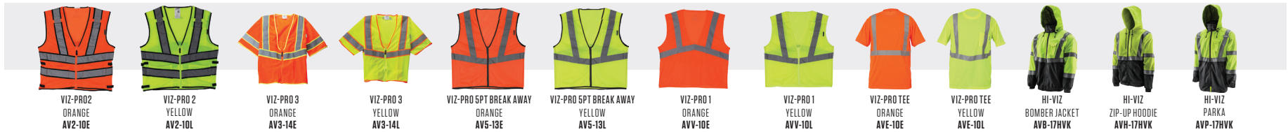
VIZ-PRO2 ORANGE AV2-10E