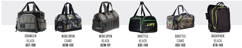
CRAWLER BLACK ACT-19K