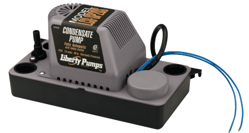
Shallow Pan Models: LCU-SP20S [115V] LCU-SP220S [230V]