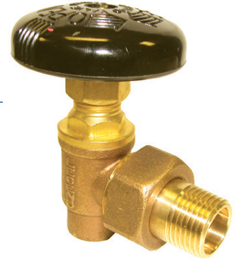
Pictured Model T-437/S-437