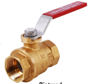
Pictured Model T-1001