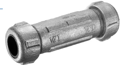
Pictured Brass Compression Coupling