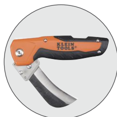
Knife shown folding into handle