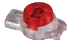
UR IDC VDV826-605 3 wire (26-19 AWG)