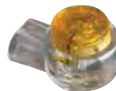
UY IDC VDV826-604 2 wire (26-22 AWG)