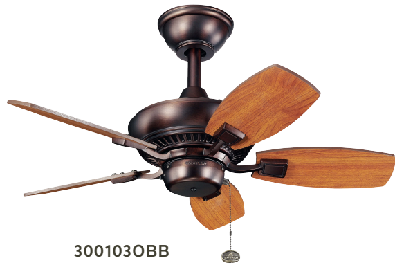
300103OBB Oil Brushed Bronze™ Finish Cherry Blades