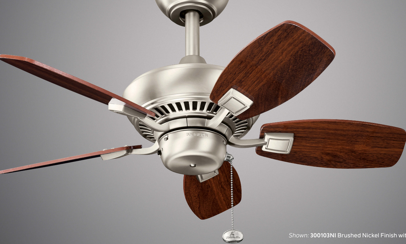
Shown: 300103NI Brushed Nickel Finish with Walnut Blades