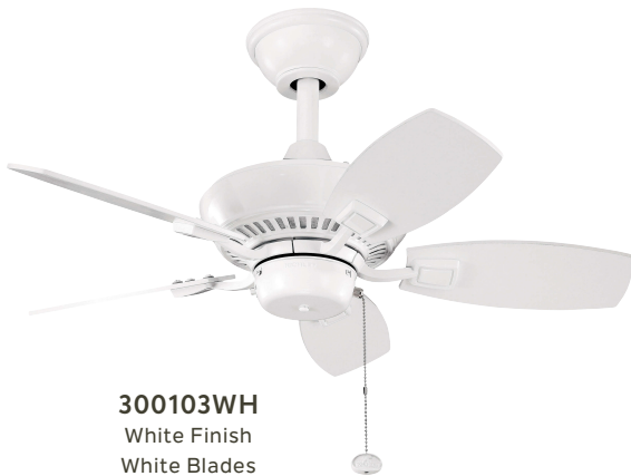
300103WH White Finish White Blades