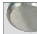
809-36 both sides