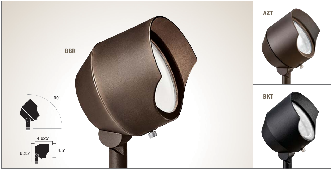
15381 AZT, AZT 6, BBR, BKT - MR-16 ACCENT LIGHT