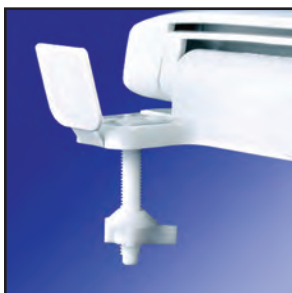
Corrosion proof, self-aligning hardware