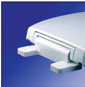
Factory-installed "living" hinge covers