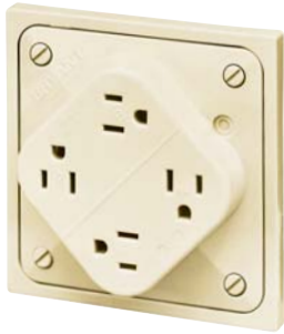
1254I with ADAP1