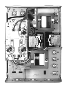
Vertical or Horizontal Mount