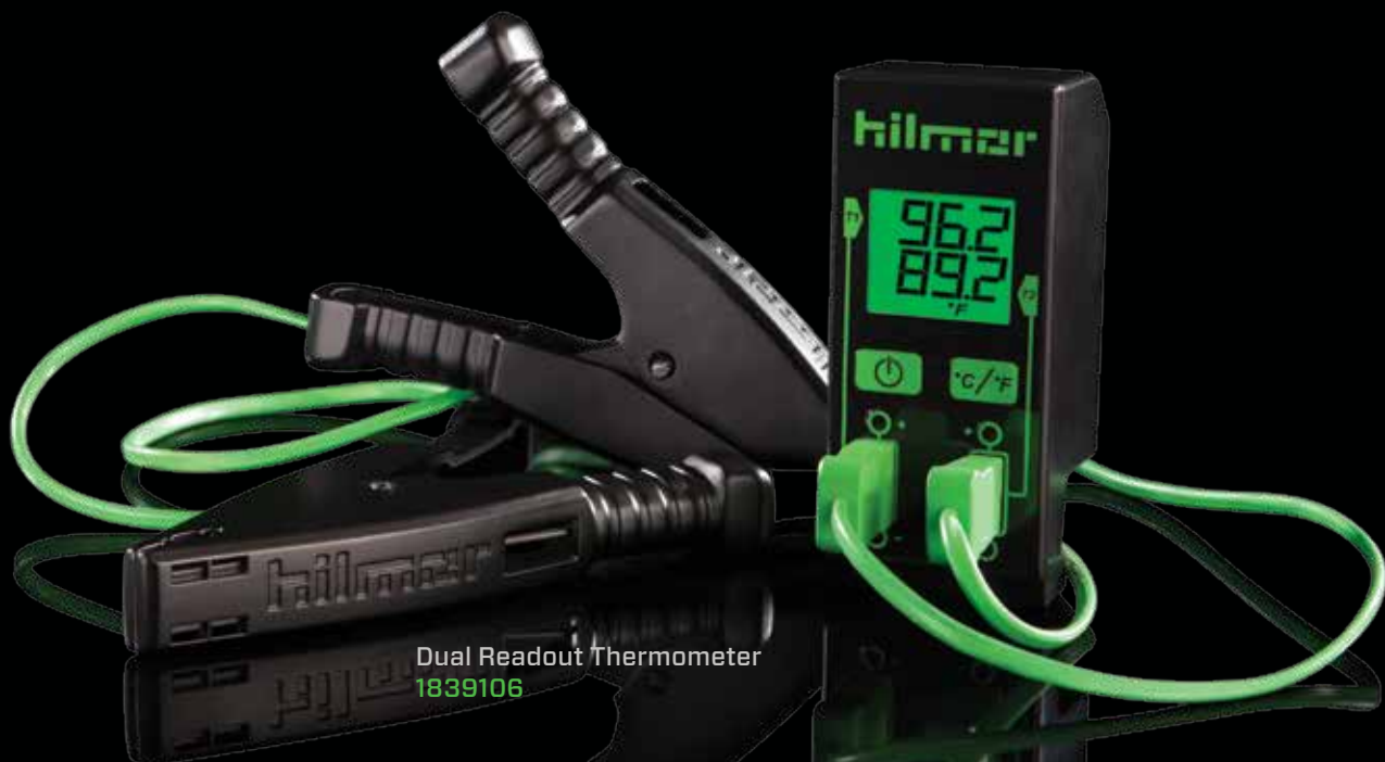
Dual Readout Thermometer 1839106