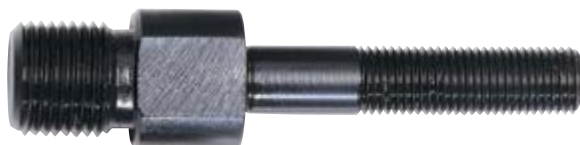
KOR50 3" x ⅜"