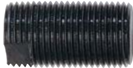
KSA50 1⅜" x ¾"