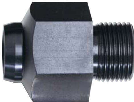
KC3540 2⅝" x 1⅛"