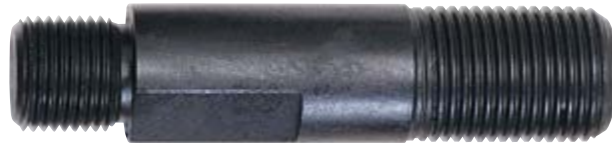
KOR75125 3⅜" x ¾"