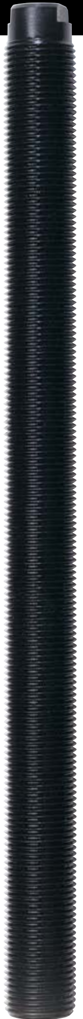
KPR7540 10⅝" x ¾"