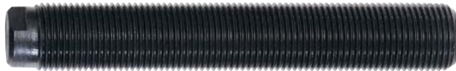
KPR7520 4⅓" x ¾"