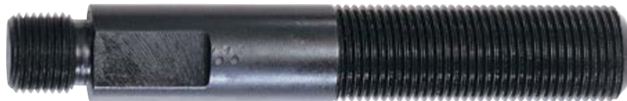
KOR152 4¾" x ¾"