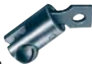
DHF All-Purpose Down Head Fitting Can be used with all standard HECS cutters.

CAA Closet Auger Attachment Guides 1/4" or 5/16" cable into bowl