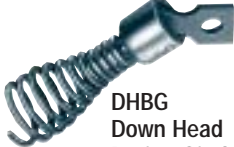
DHBG Down Head Boring Gimlet