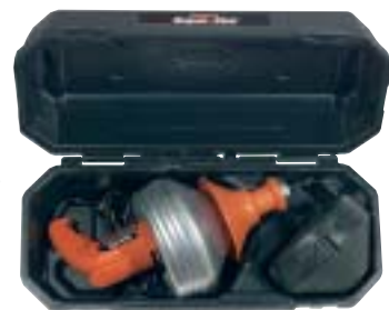
MCC Carrying Case