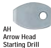
AH Arrow Head Starting Drill