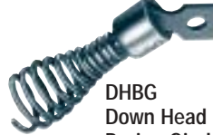
DHBG Down Head Boring Gimlet