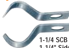
1-1/4 SCB 1-1/4" Side Cutter Blade (2 piece set)