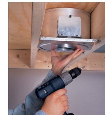
Compact housing installs between 12" on-center 2" x 8" ceiling joists.