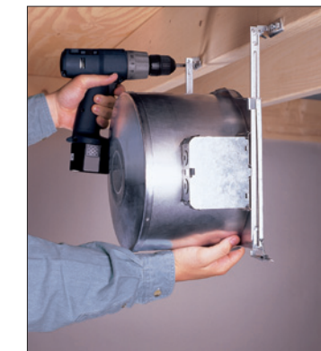
Pre-positioned hardware for quick installation in wood and steel construction. Integral nail version also available.