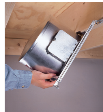
Swivel locking mechanism allows wiring below ceiling line, simplifies alignment in multi-unit installations and improves junction box access.