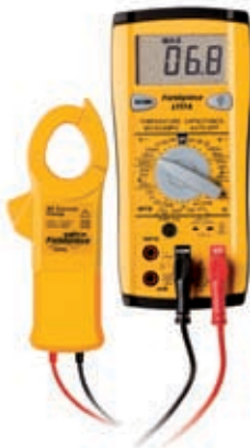
LT17A connected to AHDL1 and ACH4

Connect your digital multimeter to Fieldpiece Accessory Heads by using the AHDL1 Adapter Handle or by using Fieldpiece leads with removable probe tips (included).