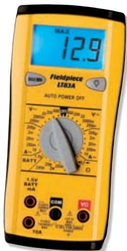
LT83A with backlight on