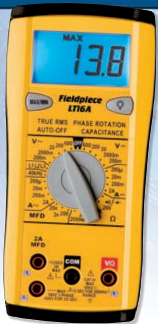
LT16A with backlight on