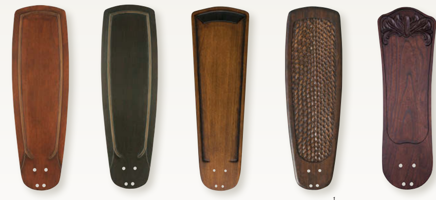
B90DO 25" Classic Carved Wood Dark Oak B90VBL 25" Classic Carved Wood Vintage Black B91WA 25" Deco Carved Wood Walnut B92VWA 1 25" Rattan Carved Wood Vintage Walnut B97DWA 25" Ornate Carved Wood Dark Walnut

DECORATIVE HAND CARVED BLADES - 25" Length, 58-60" Span Blades Solid wood blades with decorative detailing.