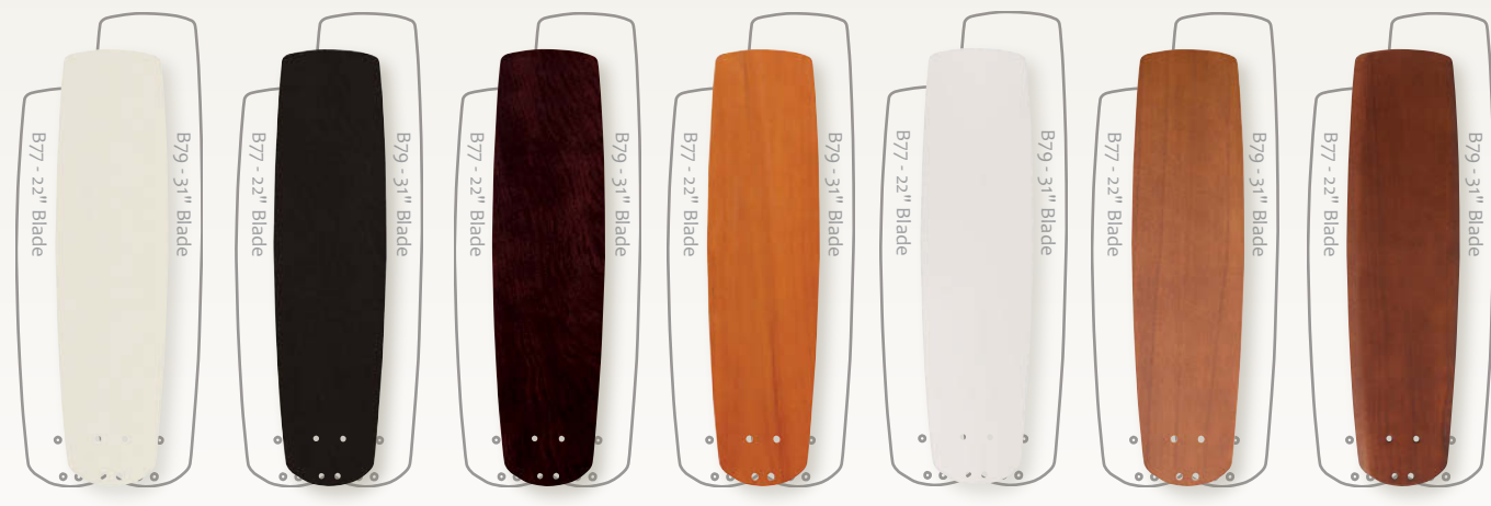
B78AW (shown) 25" Solid Wood Summer White B78CH (shown) 25" Solid Wood Chocolate B78DM (shown) 25" Solid Wood Dark Mahogany B78NC (shown) 25" Solid Wood Natural Cherry B78SW (shown) 25" Solid Wood Satin White B78TK (shown) 25" Solid Wood Teak B78WA (shown) 25" Solid Wood Walnut

SOLID WOOD BLADES - 22", 25", 31" Length, 52/54", 58/60", 70/72" Span Blades B77 blades are 22" (52-54" Span). B78 blades are 25" (58-60" Span). B79 blades are 31" (70-72" Span). All B77, B78 & B79 are suitable for damp location and indoor listed fans. These solid wood blades feature a large bevel.