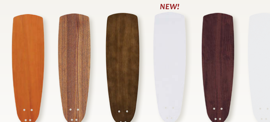
G54NC Natural Cherry G54TK/G44TK Teak G54RW Riverwash G54SW/G44SW Satin White G54WA/G44WA Walnut G54WW/G44WW Appliance White