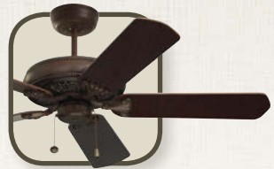
Crown Select CF4501 - pg. 22