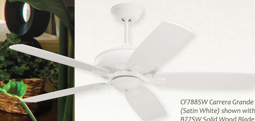
CF788SW Carrera Grande Eco (Satin White) shown with B77SW Solid Wood Blade in Satin White.

For ordering information or additional model specifications, see our full line catalog or go to emersonfans.com