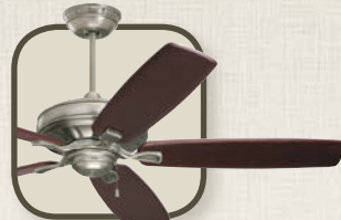
Carrera Grande CF787 - pg. 6