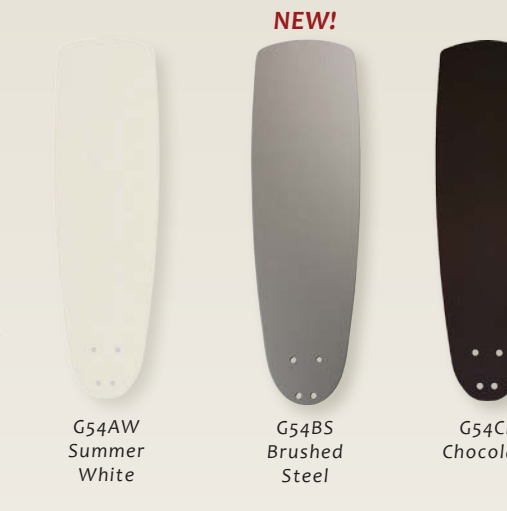
G54AW Summer White G54BS Brushed Steel G54CH Chocolate

WOOD VENEER BLADES 1 • G54 Series: 22" Length, 52-54" Span Blades • G44 Series: 18" Length, 42-44" Span Blades Micro-balanced within one gram. Six-layer wood veneer blades are cross-laminated for stability and warp resistance. Sealed to resist moisture. AW, BS, CH, SW, WW Finishes are custom painted to match housing.