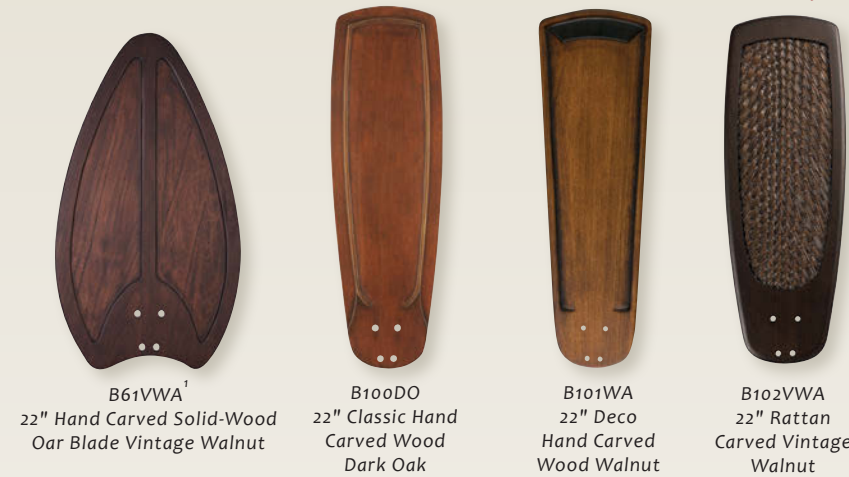
B61VWA 1 22" Hand Carved Solid-Wood Oar Blade Vintage Walnut B100DO 22" Classic Hand Carved Wood Dark Oak B101WA 22" Deco Hand Carved Wood Walnut B102VWA 22" Rattan Carved Vintage Walnut

DECORATIVE HAND CARVED BLADES - 22" Length, 52-54" Span Blades Solid wood blades with decorative detailing.