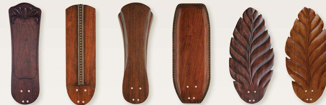
B103DWA 22" Ornate Hand Carved Wood Dark Walnut B105HCB 22" Hand Carved Wood Beaded Walnut B107HCT 22" Hand Carved Wood Tapered Dark Walnut B108HCW 22" Hand Carved Wood Walnut B109DC 22" Hand Carved Leaf Dark Cherry B109DO 22" Hand Carved Leaf Dark Oak