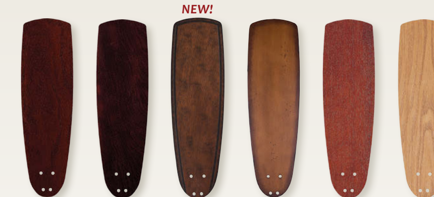
G54DC/G44DC Dark Cherry G54DM Dark Mahogany G54HO Heritage Walnut G54HO Honey Oak G54MH Mahogany G54MO Medium Oak