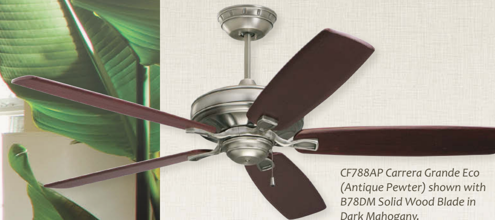
CF788AP Carrera Grande Eco (Antique Pewter) shown with B78DM Solid Wood Blade in Dark Mahogany.