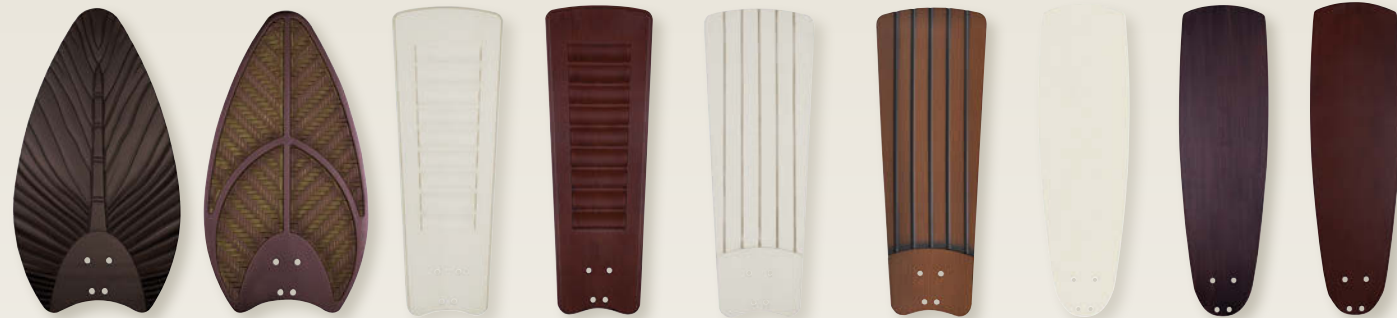
B62VBL 1 22" Palmetto Blade Vintage Black Finish Weather-Resistant Resin B63ASW 1 22" Rattan Leaf Blade Antique Stain Wicker Finish Weather-Resistant Resin B110AW 22" Shutter Blade Summer White Finish Weather-Resistant Resin B110WA 22" Shutter Blade Walnut Finish Weather-Resistant Resin B112AWL 22" Wainscoting Blade Summer White with Latte Highlights Finish Weather-Resistant Resin B112MAB 22" Wainscoting Blade Medium Antique Brown Finish Weather-Resistant Resin G54WAW 22" Blade Summer White Finish Weather-Resistant Resin G54WVNB 22" Blade Venetian Bronze Finish Weather-Resistant Resin G54WWA 22" Blade Walnut Finish Weather-Resistant Resin

WEATHER RESISTANT BLADES - 22" Length, 52-54" Span Blades Our weather resistant blades are made of resin with a UV protective coating. For a fan to qualify as wet location, the housing must also be rated wet location.