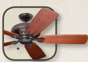
Penbrooke Select CF5100 - pg. 2

Choose from any of the blades shown on these pages to complete your custom Blade Select Series ceiling fan. All Blade Select Series blades shown are compatible with the following ceiling fans. Some restrictions apply. Refer to footnotes for compatibility.