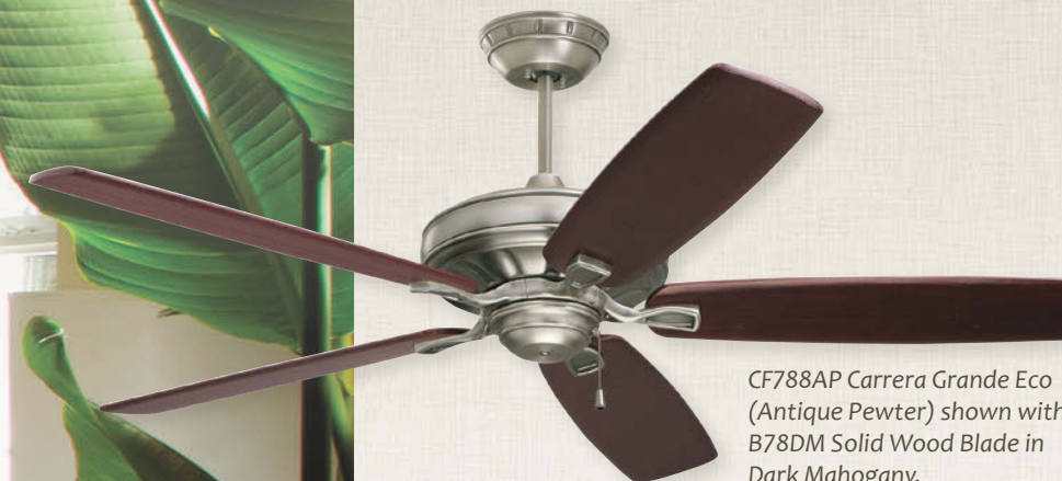
CF788AP Carrera Grande Eco (Antique Pewter) shown with B78DM Solid Wood Blade in Dark Mahogany.