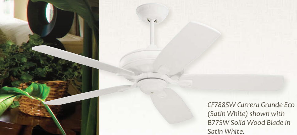
CF788SW Carrera Grande Eco (Satin White) shown with B77SW Solid Wood Blade in Satin White.

For ordering information or additional model specifications, see our full line catalog or go to emersonfans.com