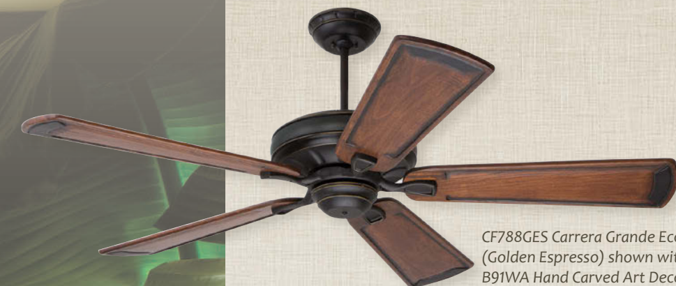
CF788GES Carrera Grande Eco (Golden Espresso) shown with B91WA Hand Carved Art Deco Blade in Walnut.