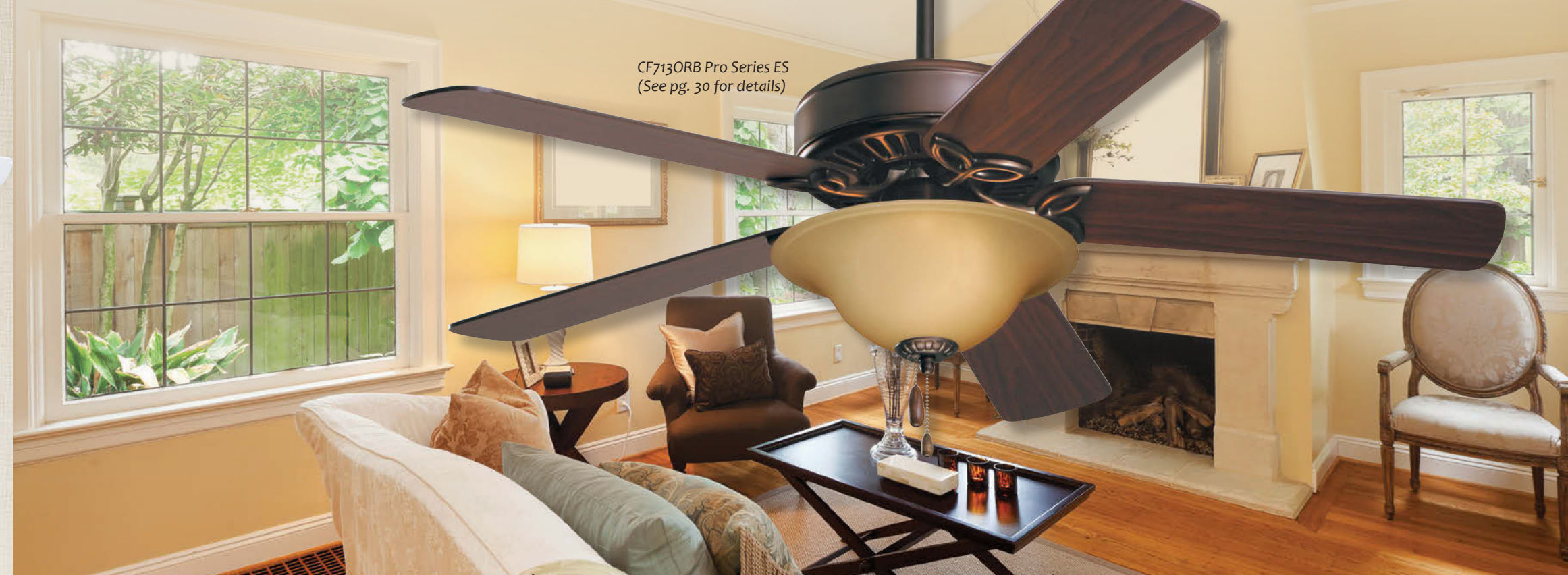
CF713ORB Pro Series ES (See pg. 30 for details)